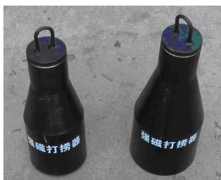
强磁打捞器 Strong magnetic fishing tools