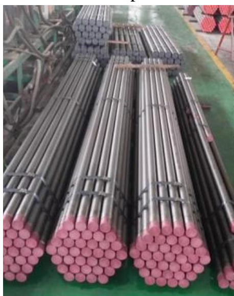
XJY950 钢级钻杆 XJY950 drilling rod