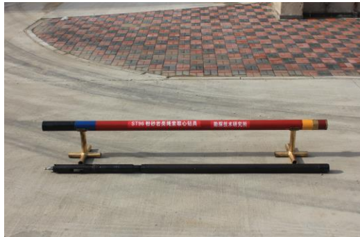
ST-96 绳索取心钻具 ST-96 wire-line coring tools