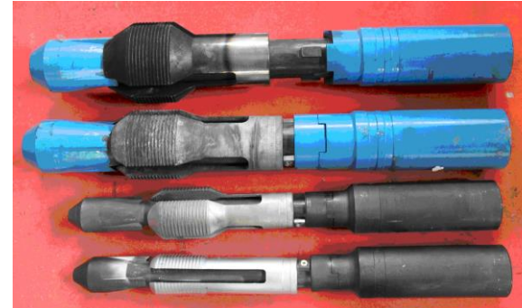
可退式打捞工具 Releasing fishing tools