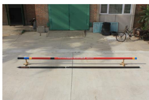
SYZX96 绳索取心液动锤钻具 SYZX96 hydraulic DTH hammer coring tool